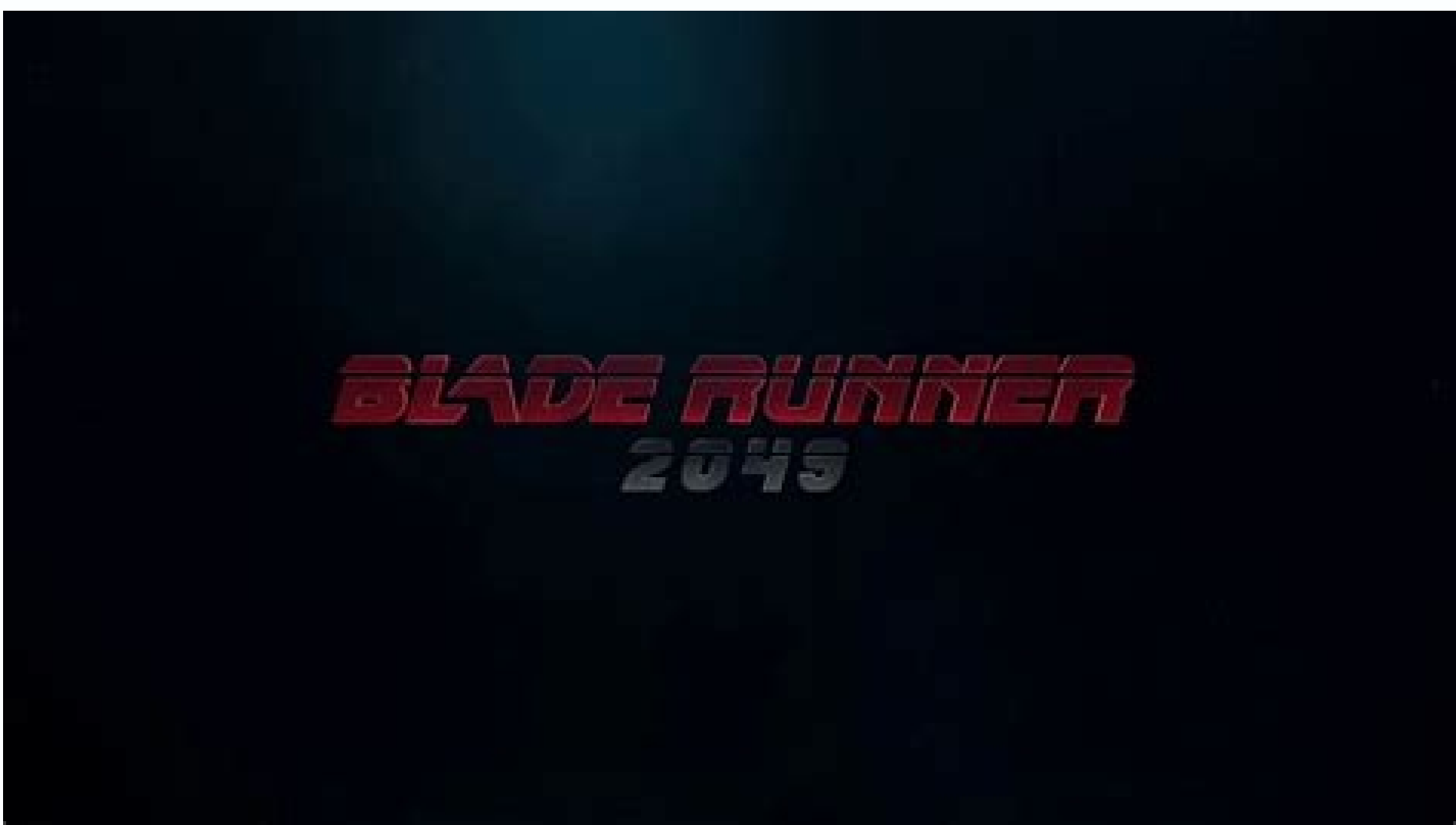
The best blade runner version. The movie blade runner 2049.